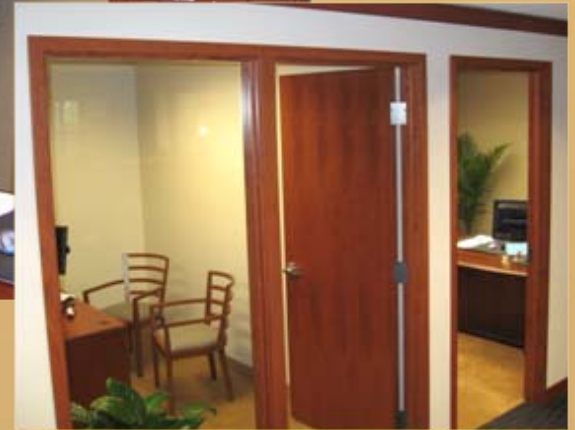
Door with Sidelight