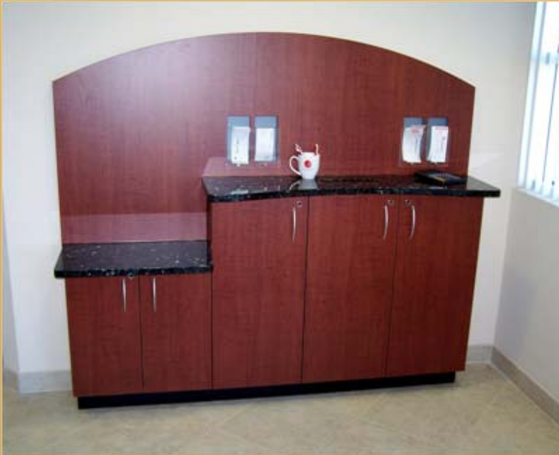
Coffee Bar with storage and brochure display