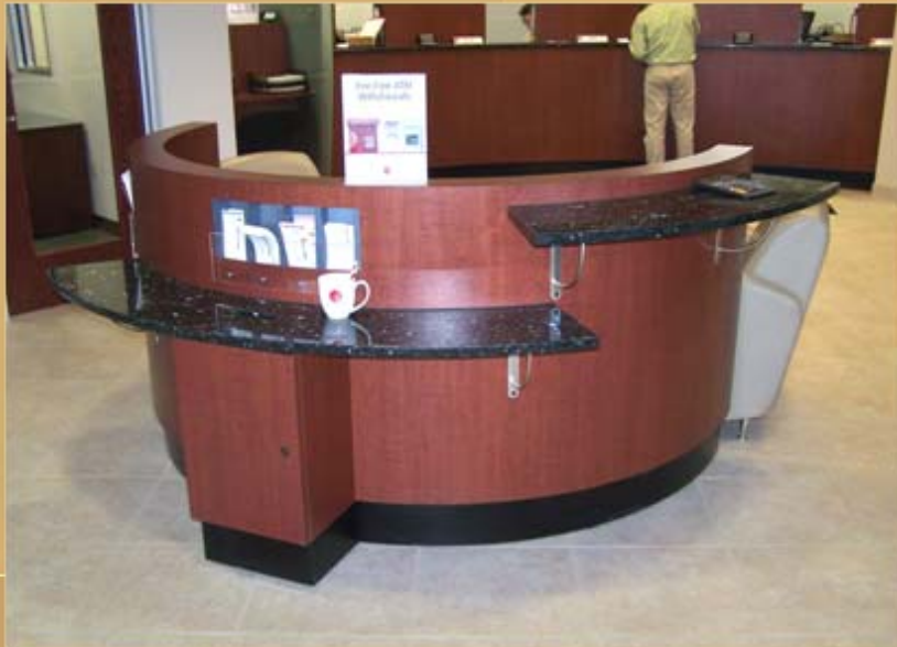
Check Stand and brochure display

High pressure laminate wood tones, combined with granite tops, metal brackets and glass panels result in a modern and durable product.