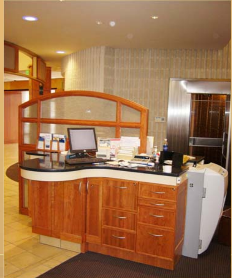
Dialogue Banking Station