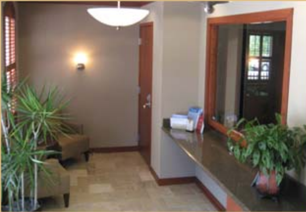
Lobby – Opposite

This full interior package showcases our ability to provide a singular solution to interior furnishings, millwork, casework, doors and trim anywhere in the country.