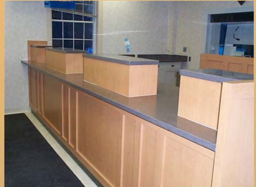
Teller Line – Customer Side