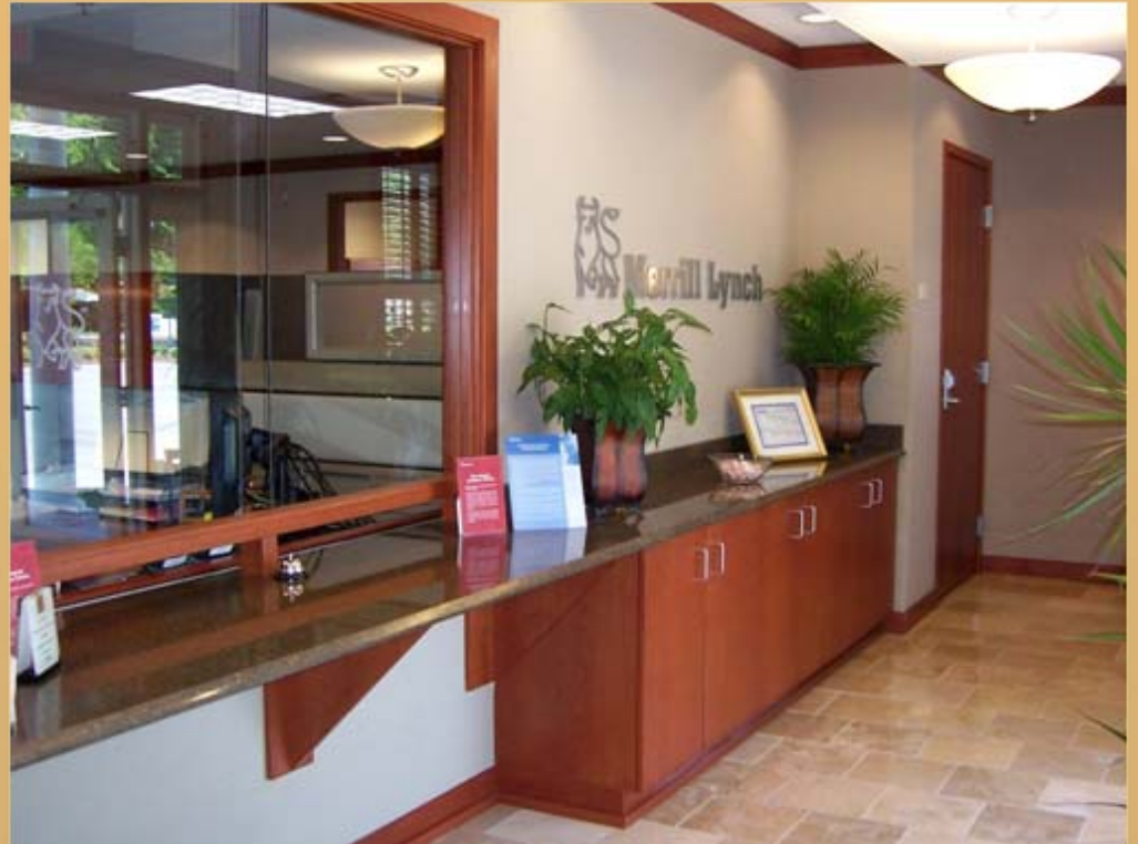
Lobby Veneer Casework, Pass Through Window, Door, Base & Crown