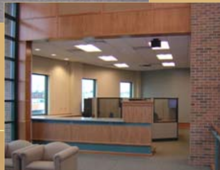
Lobby to Offices