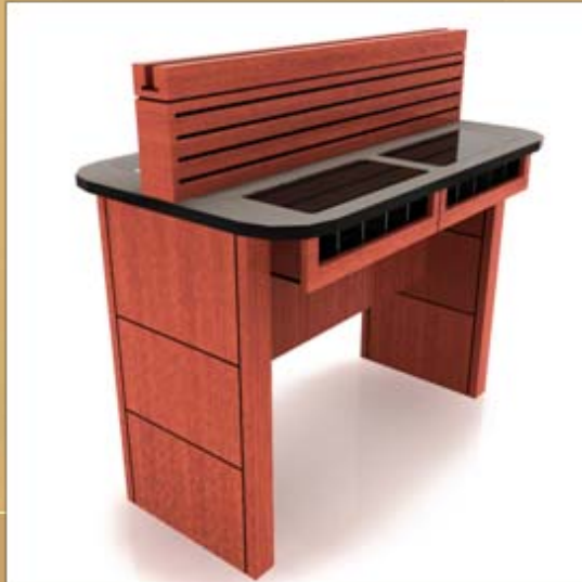
Double Sided Check Stand

The Advantage Branch line of modular banking furniture provides a turnkey solution to the banking industry. Ideal for boutique banks the prototypes are easily modified to suit your branding needs