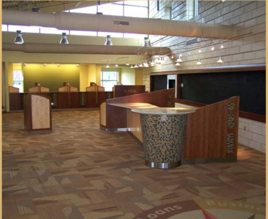
View from Entry

This Yamasaki designed facility showcases stained cherry hardwood and veneers complemented by natural maple accents. Glass tile details, Corian and Formica solid surface tops, and stainless steel kicks and grommets complete the innovative space.