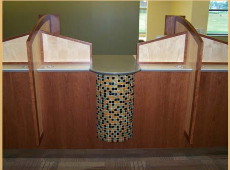
Teller Station – Customer Viewpoint