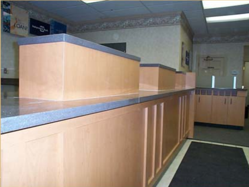
Teller Line – Customer Side

A more typical straight teller line in cost effective finishes, results in a comfortable and familiar banking environment.