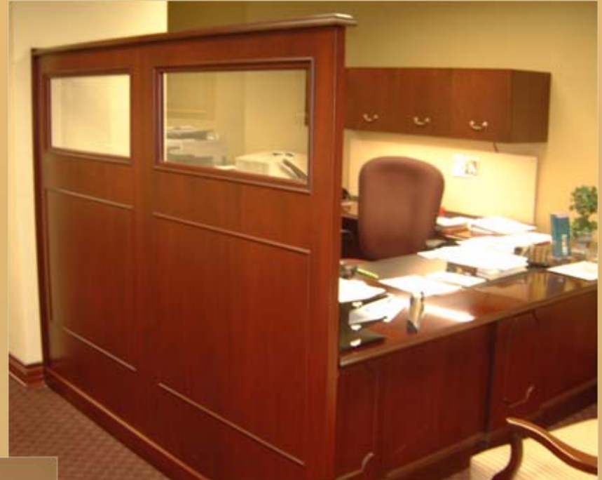
Office Desk with Return and Wall Storage