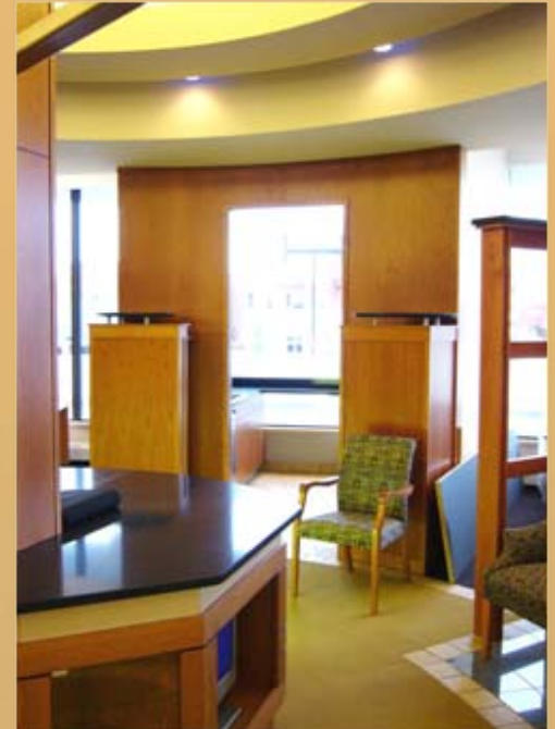
Check Stand to Workroom