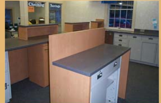
Teller Line – Teller Side