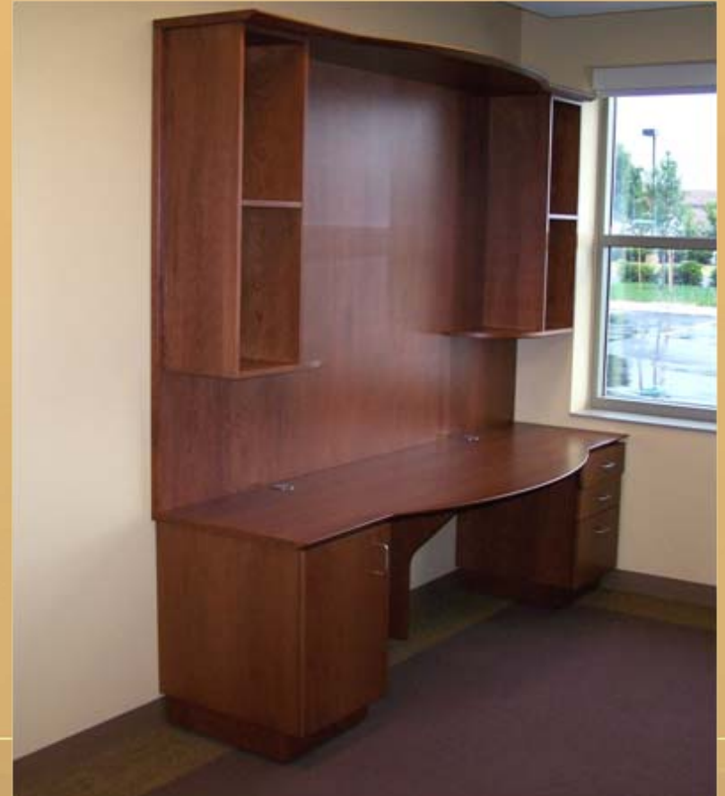
Personal Advisors Office