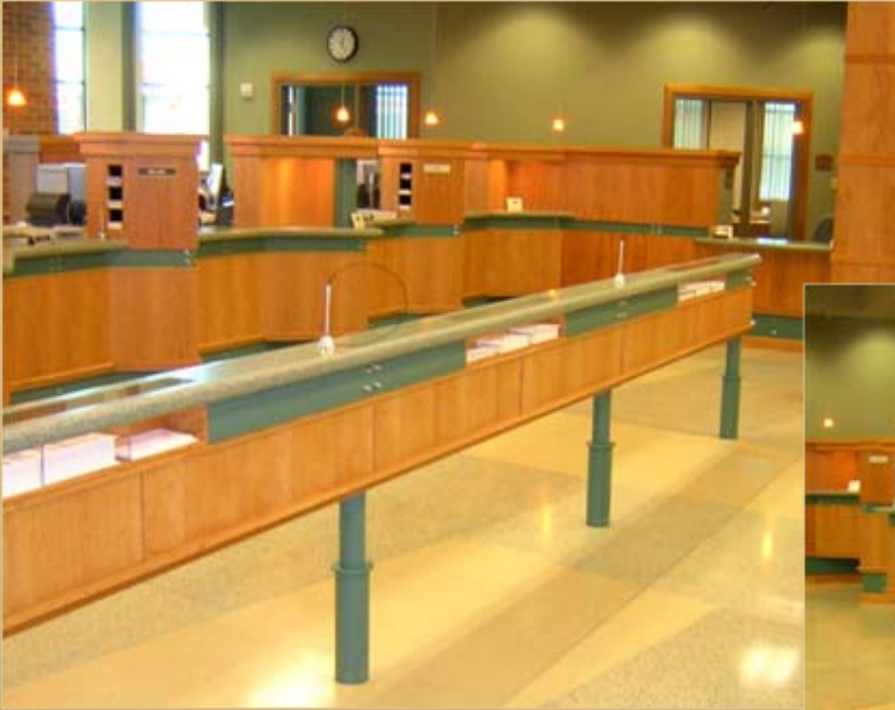
Teller Queuing Prep Stand