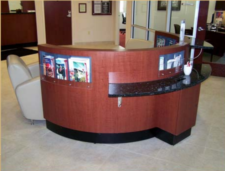
Check Stand and brochure display