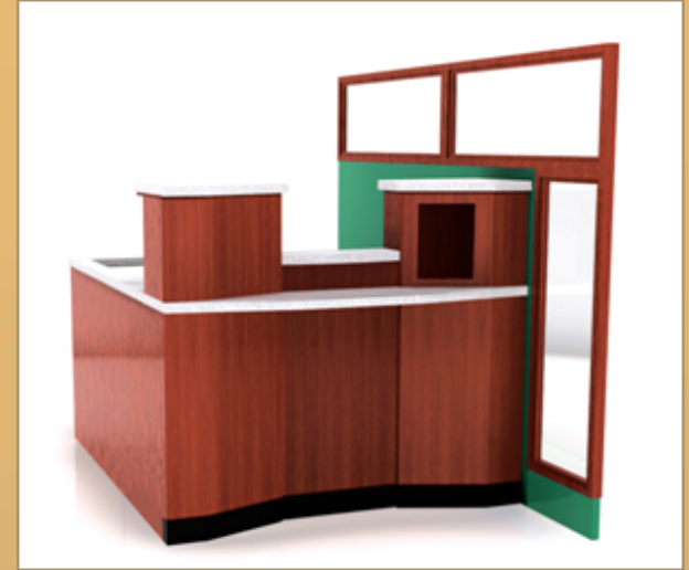
Teller Unit with Privacy Wall