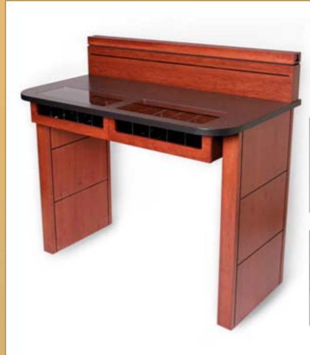
Single Sided Check Stand