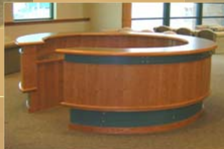
Reception Back – Second Floor