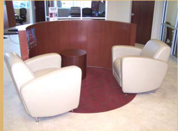
Lounge area inside check stand