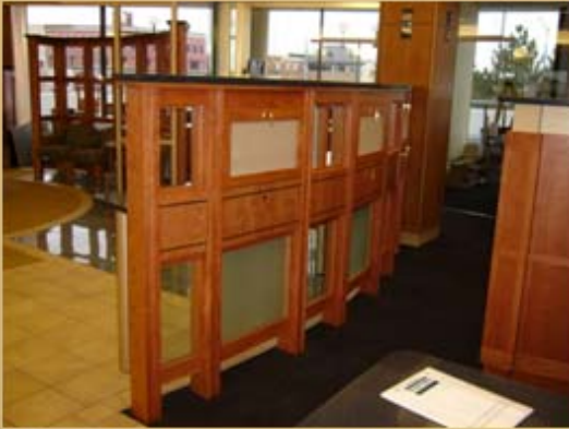
Internet Banking - Back

This unique design uses a different approach to banking, with a bold style and customer friendly atmosphere. Cherry, Silestone, Laminated Glass, and Integrated Technology all combine for the result you see.