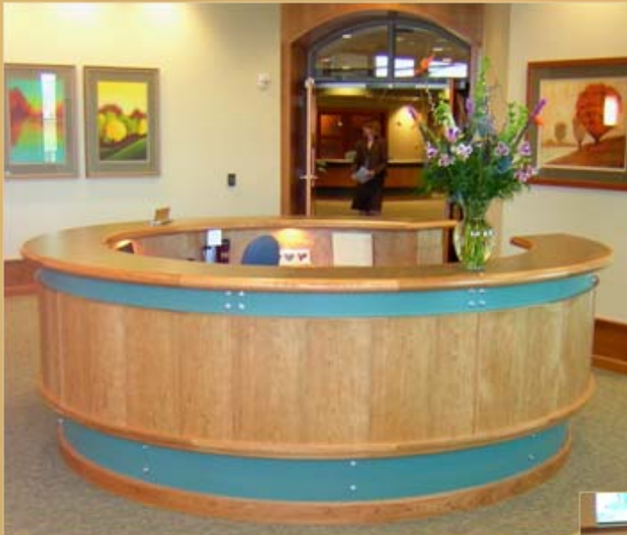
Reception – Second Floor