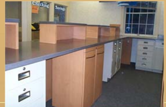
Teller Line – Teller Side