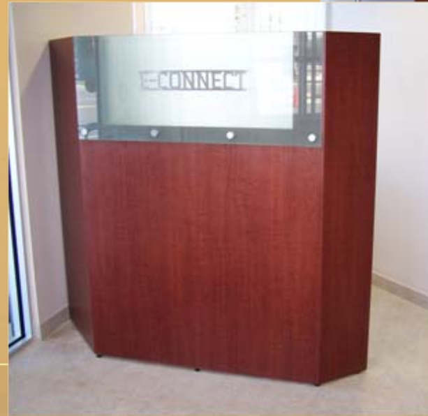
“E-CONNECT”, Internet banking station