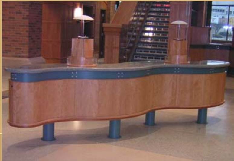
Check Writing Stand