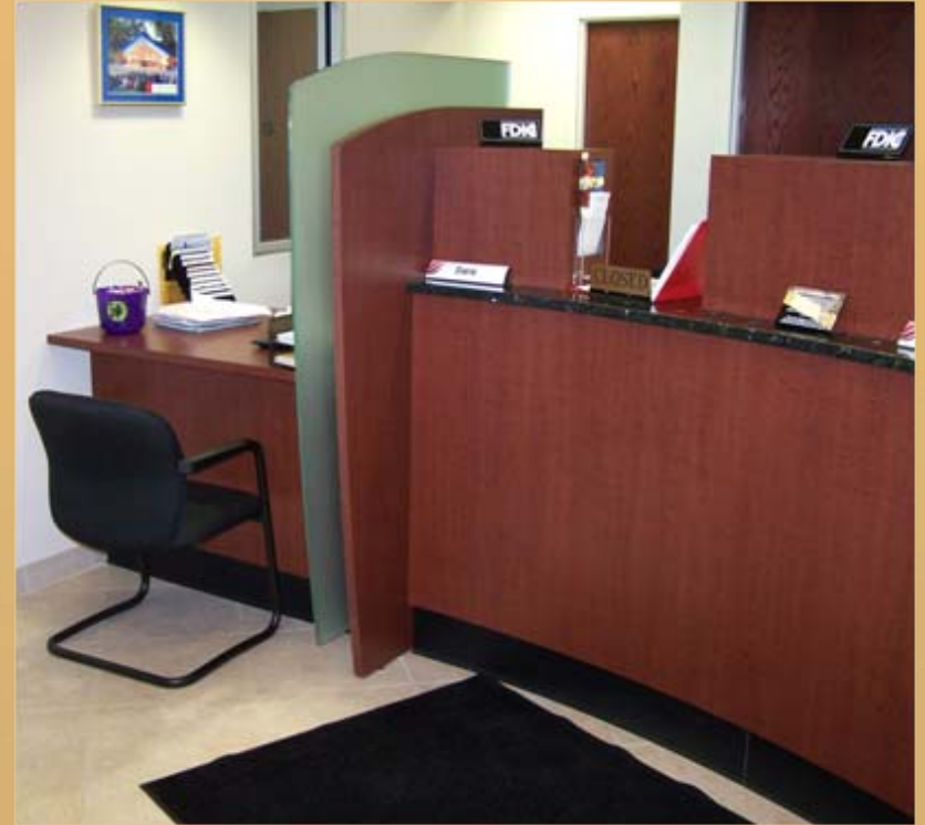
Teller Line with ADA station