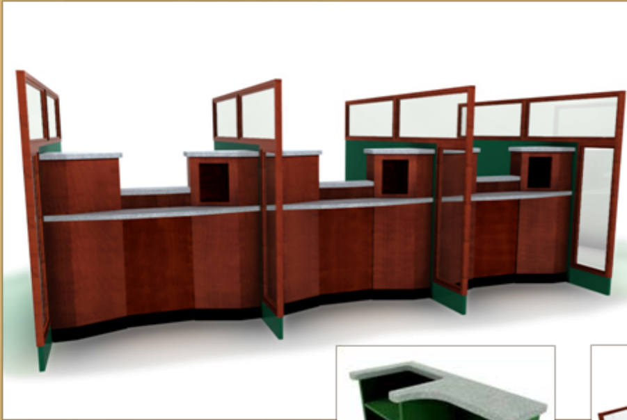
Teller Line – 3 Stations